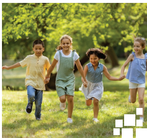
Exercise in Childhood