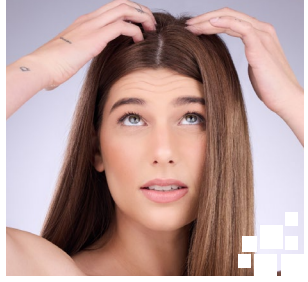
Checking for Head Lice