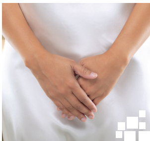
Stress incontinence in women