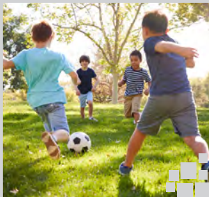
Exercise in Childhood